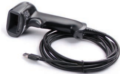
1 SMART TRACK Scanner