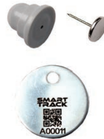
200 SMART TRACK 2D bar code tags with permanent security-style backing